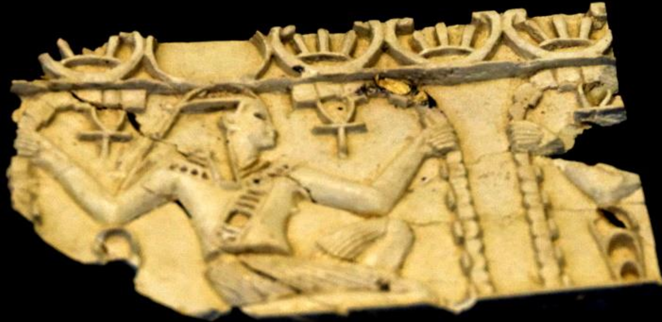
Ivory furniture inlay, from Samaria, 9th–8th centuries BC

All that he did, and the house of ivory that he built