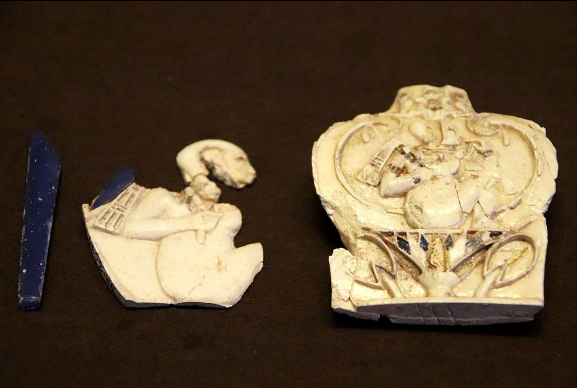
Ivory furniture inlay, from Samaria, 9th–8th centuries BC

All that he did, and the house of ivory that he built