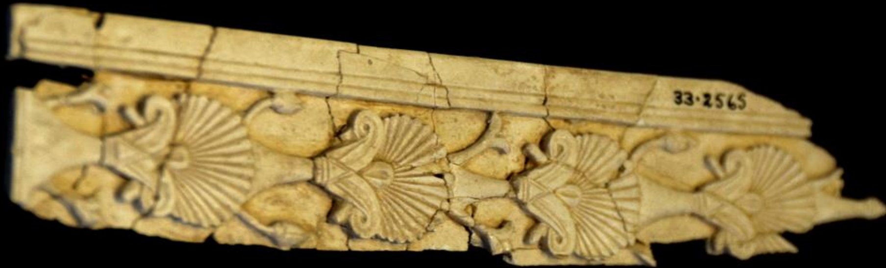
Ivory furniture inlay, from Samaria, 9th–8th centuries BC

All that he did, and the house of ivory that he built