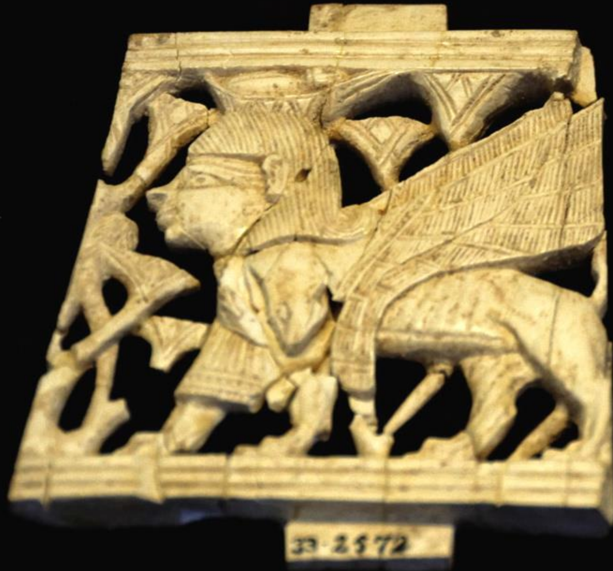
Ivory furniture inlay, from Samaria, 9th–8th centuries BC

All that he did, and the house of ivory that he built