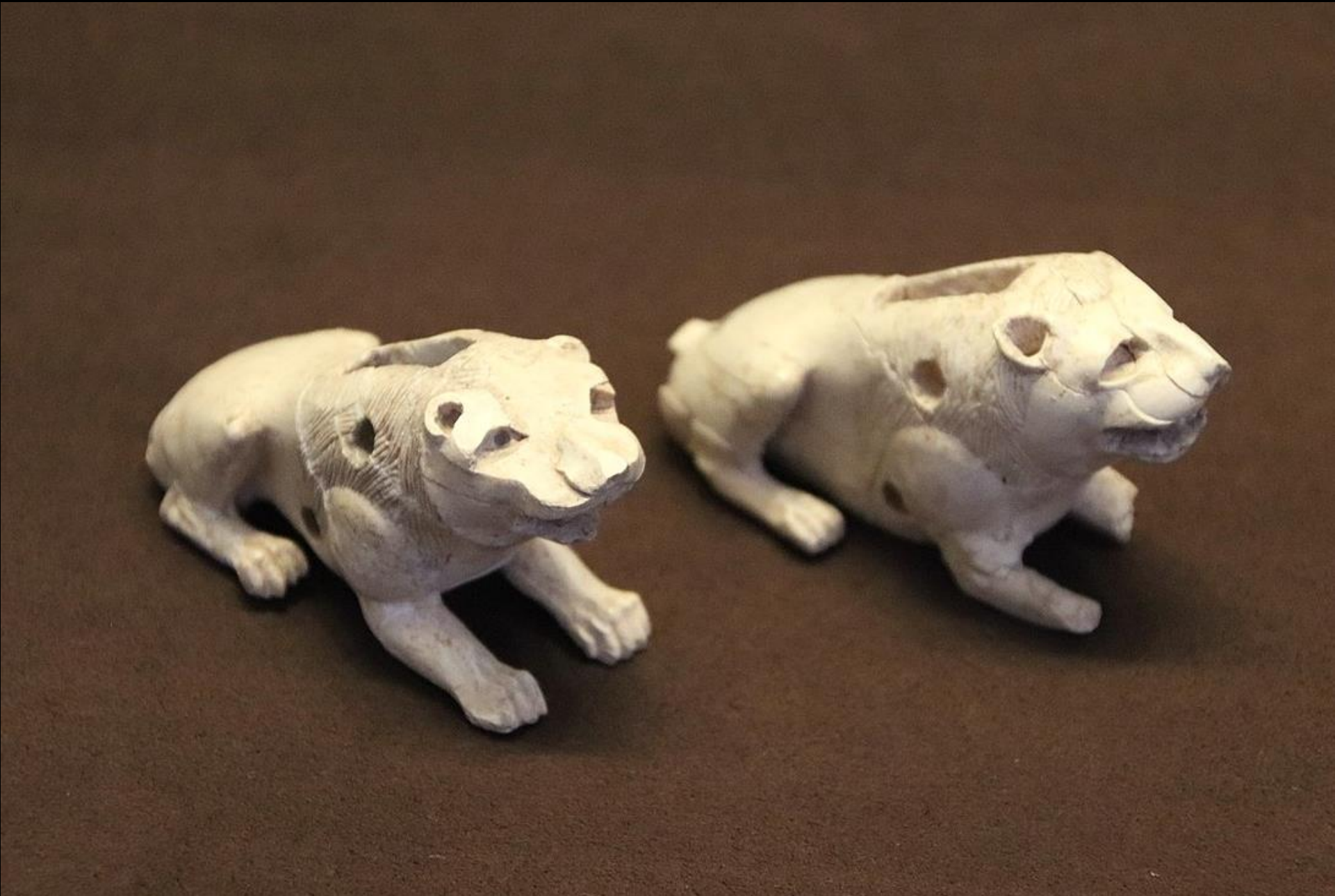
Ivory furniture inlays in high relief, from Samaria, 9th–8th centuries BC

All that he did, and the house of ivory that he built